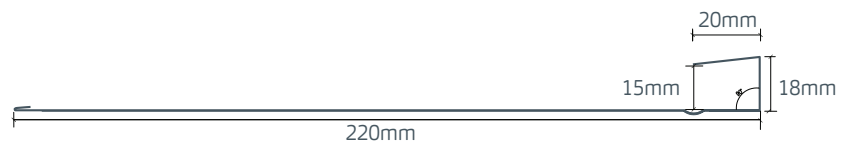
Fibre Cement Slate