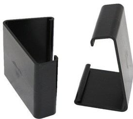
C08PJEBL External Jointer