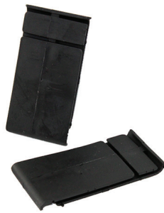
C08PFJIBL Standard Internal Jointer