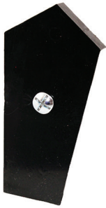
C08PFABL Apex Jointer