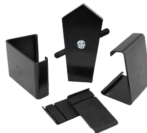
C08PFBL Complete Pack