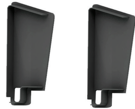
C08PFEBL Standard End Cap